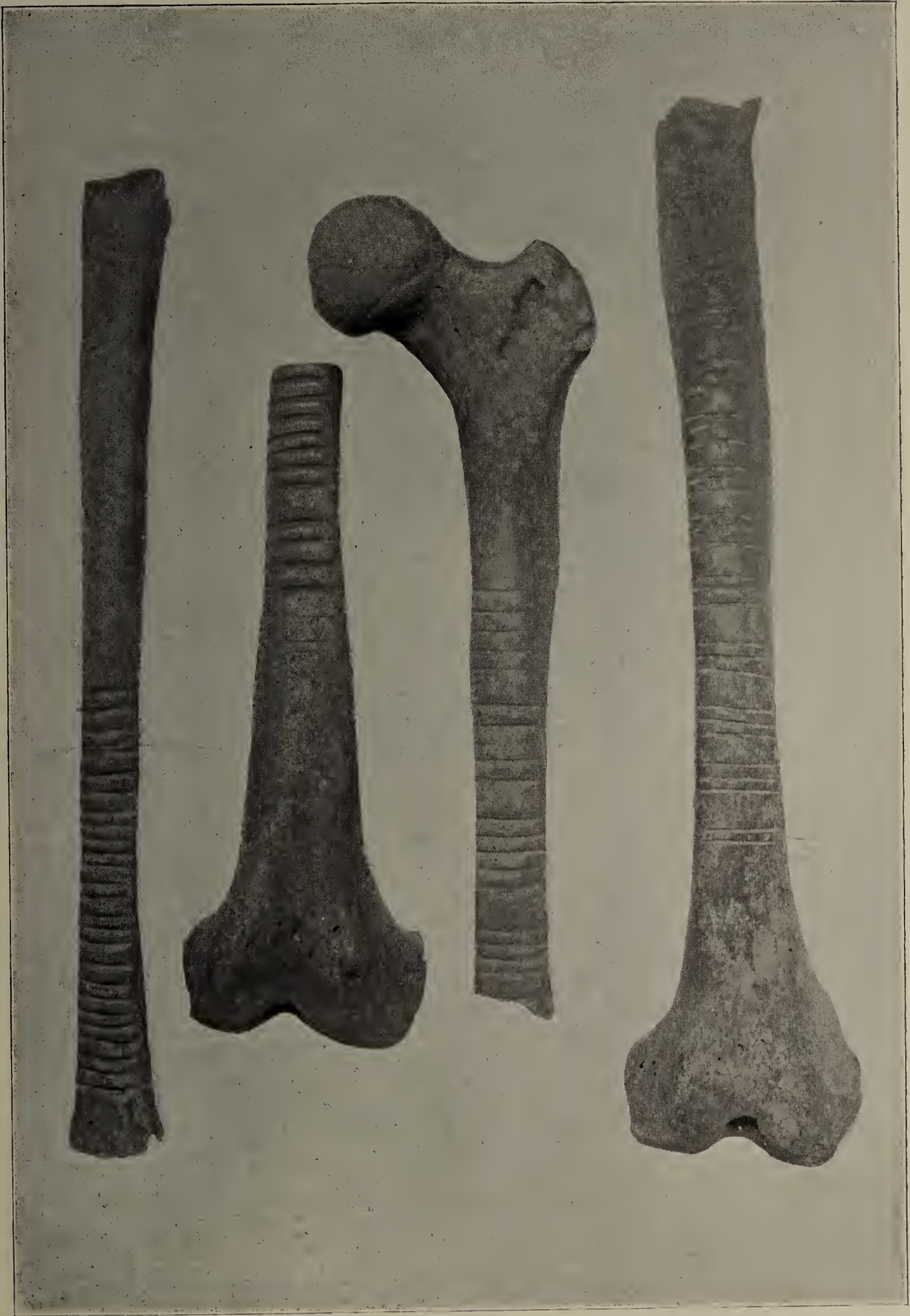
VARIETIES OF MARKING.